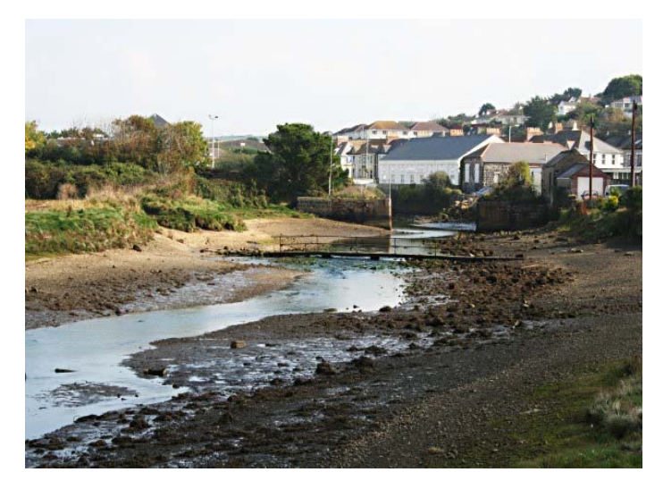
Copperhouse Pool (Angarrack Stream)*

We want to improve water quality in the Angarrack and Stennack streams in Cornwall. This briefing note sets out the pressures facing the water environment in the catchment.